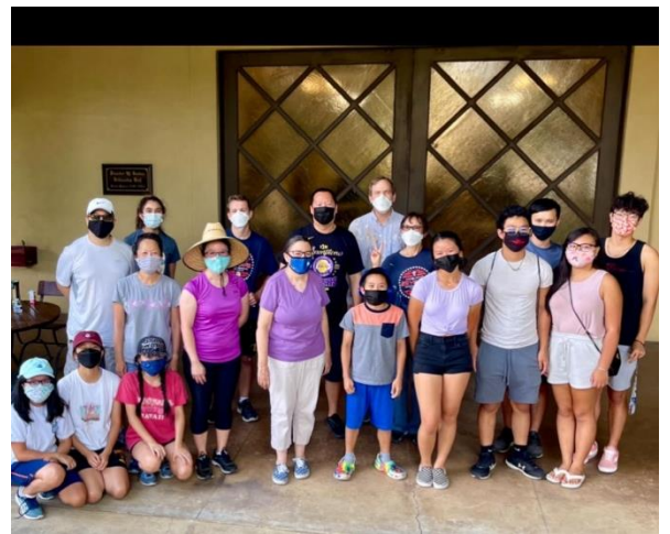
Group photo of SSP/VBS participants!