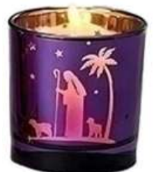
Advent Candle of Hope